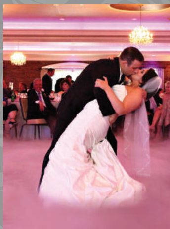
Dancing on the Clouds - starting at $250