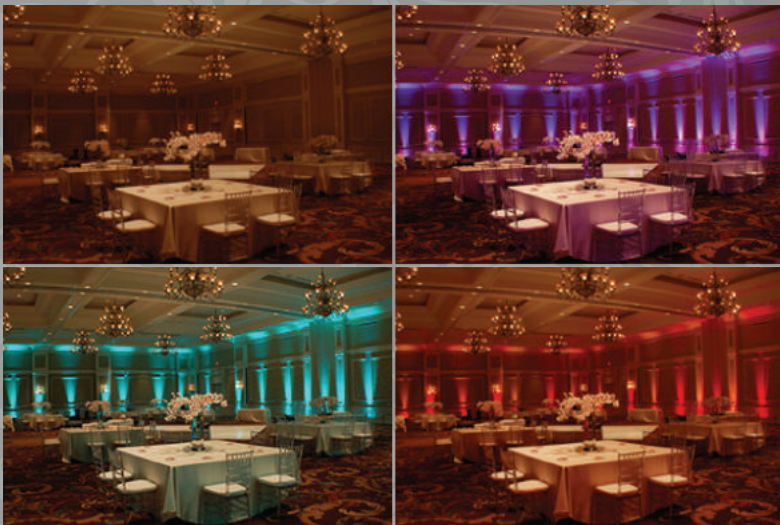
Uplights - starting at $150