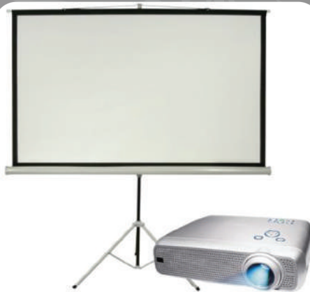
Projectors & Screens starting at $150