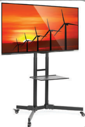
60" LED Display - starting at $250