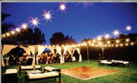
Bistro Lights - Starting at $250