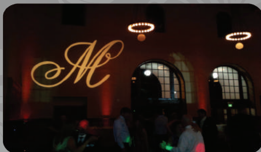
Monograms - starting at $100