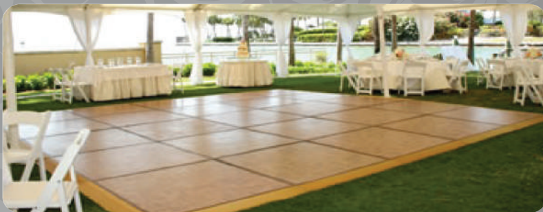
Many Dance Floor Styles- starting at $250